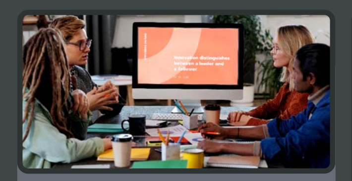
Execution & Monitoring