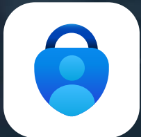
Microsoft Authenticator Microsoft Corporation