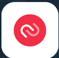
Twilio Authy Authenticator Authy