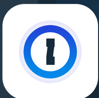
1Password: Password Manager AgileBits In-app purchases